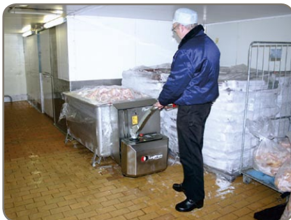
Panther Maxi RF-SEMI is here used in a cold store.