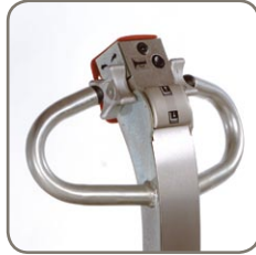
Can be operated with the handle upright. Central location of all control buttons.