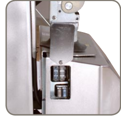
Easy access to all components makes it easy to service the truck.