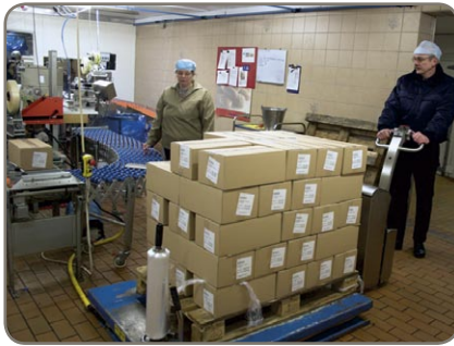
RF-SEMI - when carrying pallets in areas with strict hygiene demands, such as in the food industry.